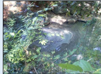
Grease in a campus stream after a home football game

Pollution goes through the storm drain system and enters streams