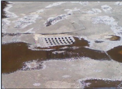
Cooking grease spilling into a storm drain

All storm drains on UNC's campus connect directly to local streams