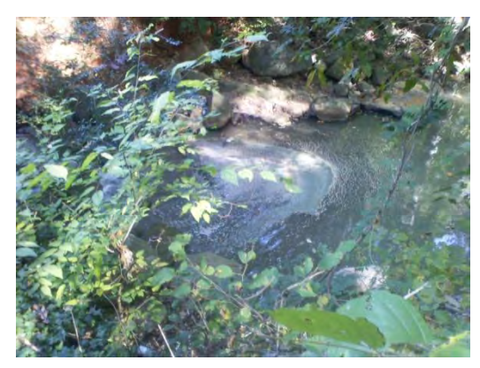
Grease in a campus stream after a 2011 UNC Home Football Game