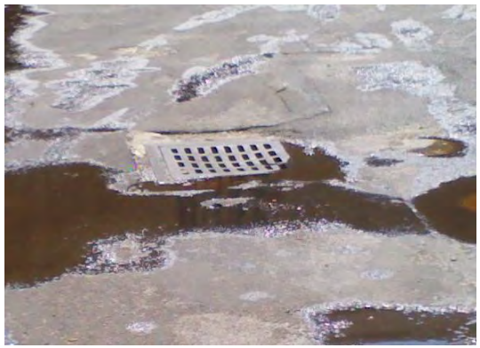
Kitchen grease spilling into a storm drain on campus (2012)

**** All storm drains on campus discharge directly to local streams ****