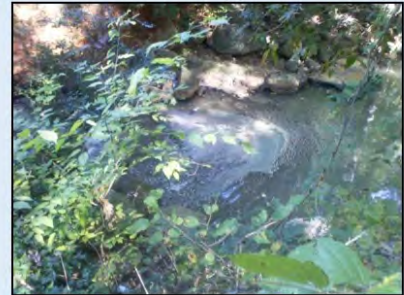
Grease in a campus stream after a home football game

Pollution goes through the storm drain system and enters streams