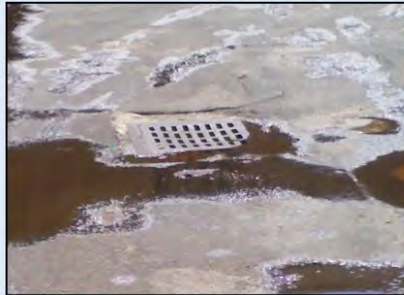
Cooking grease spilling into a storm drain

All storm drains on UNC's campus connect directly to local streams