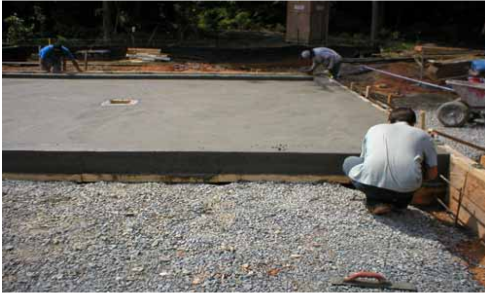
View of slab. Equipment control room in foreground and equipment room in background