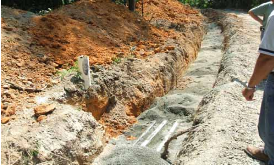
View of trench compaction adjacent to DRW-2