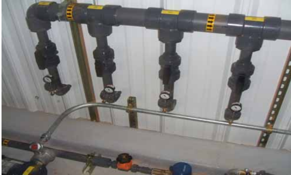
View of building interior and settling tank