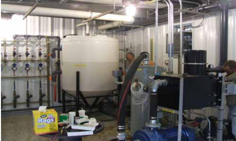
View of air stripper unit