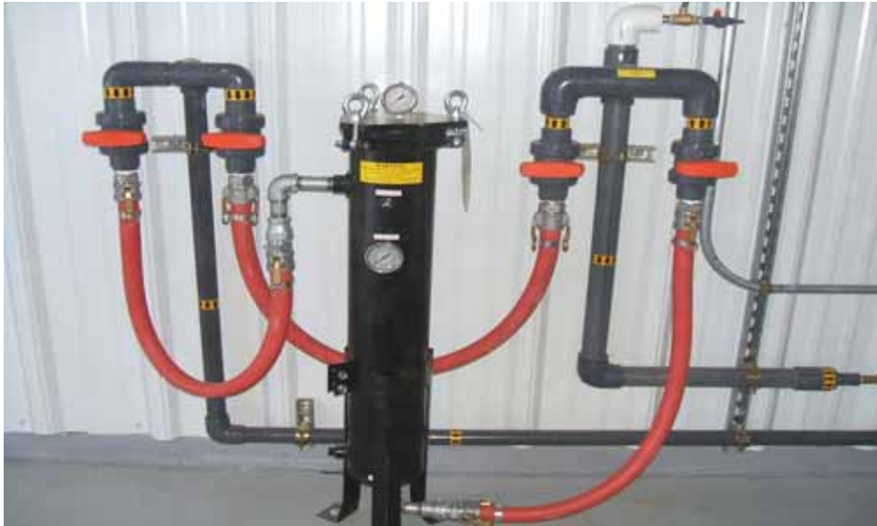
View of tank for temporary storage of treated water