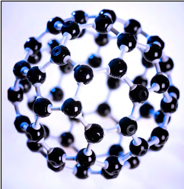
An example of a nanoparticle is a buckyball or fullerene.