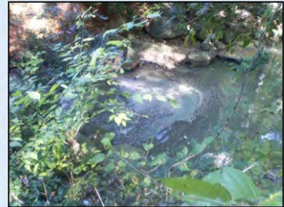
Grease in a campus stream after a home football game

Pollution goes through the storm drain system and enters streams