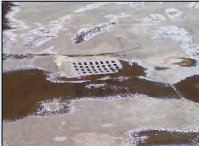
Cooking grease spilling into a storm drain

All storm drains on UNC's campus connect directly to local streams